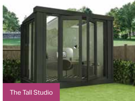
The Tall Studio

Perfect for the corner of a garden, the Studio's design maximises space within planning permission regulations- ideal for a home office or a small outdoor living space.