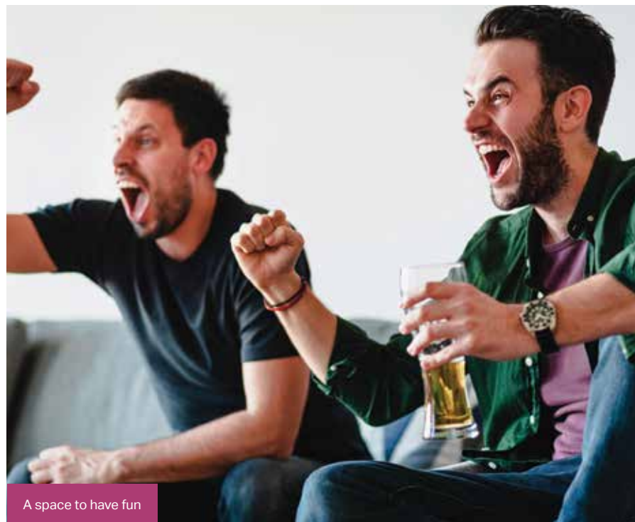
A space to have fun

Appreciate the beauty of the outdoors and have fun in the warmth of an Ultraframe Garden Room.