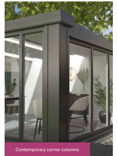
Contemporary corner columns