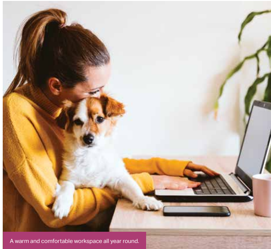
A warm and comfortable workspace all year round.

Providing a warm and comfortable workspace all year round, they are also very efficient to run. Our range of floorplans give you plenty of options for break-out areas and co-working.