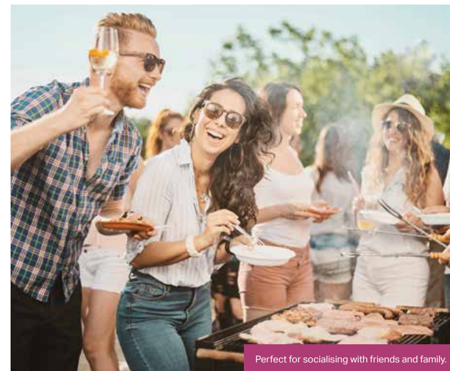
Perfect for socialising with friends and family.

Surrounded by views of your garden, and in the privacy of your own home, your own personal fitness hub at the end of the garden will be better than going to the gym.