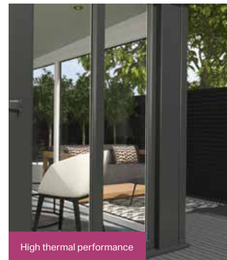
High thermal performance