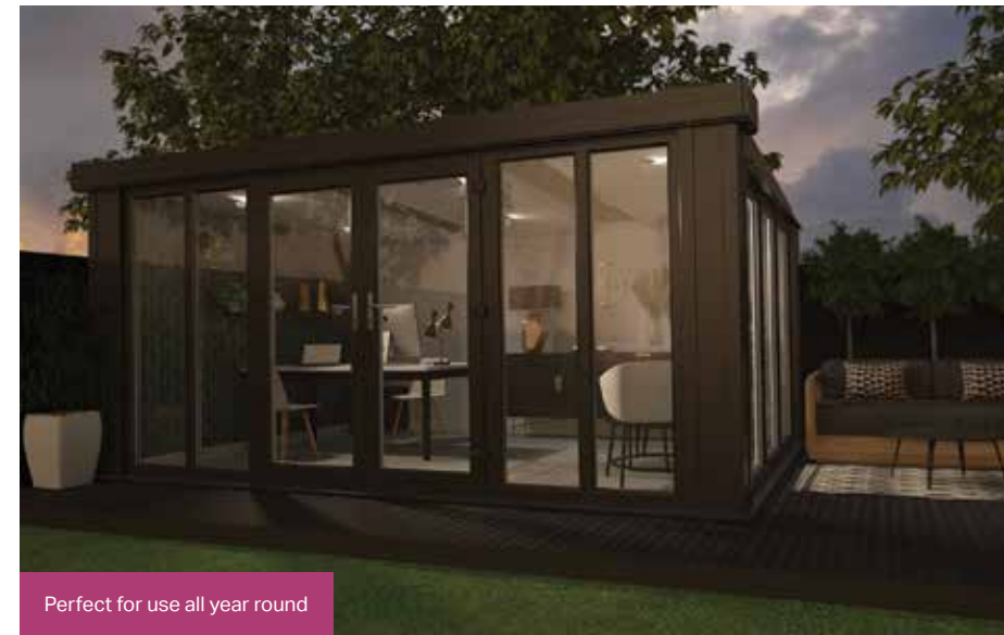
Perfect for use all year round