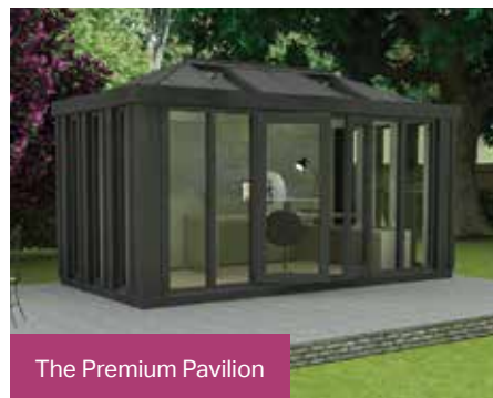
The Premium Pavilion

This grand design adds a luxurious finish to your garden, with its high roof, extensive glazing choices and high thermal performance perfect for a superior garden retreat.