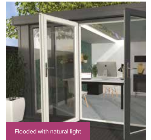
Flooded with natural light